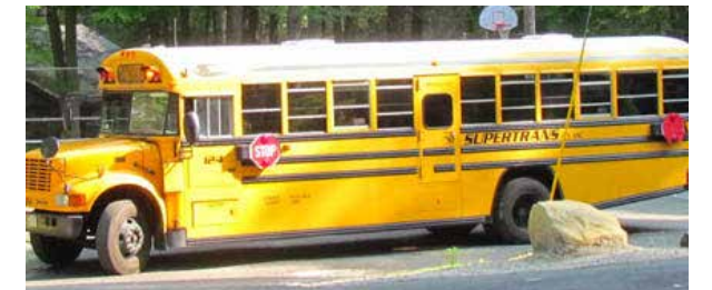
Air-Conditioned trip buses were new for 2017!